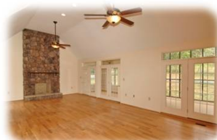
Family Room with Fireplace