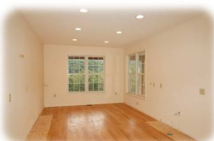
Kitchen with Breakfast Area

3590 Pine Grove Road - Stanley, VA Offered for $475,000