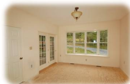
Main Level Master Bedroom