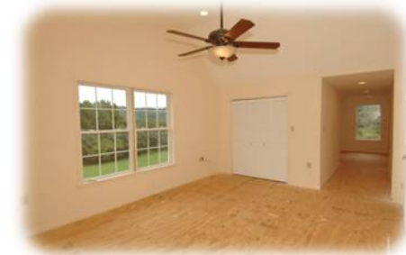
Upper Level Master Suite