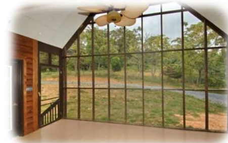
Private Screened-in Porch