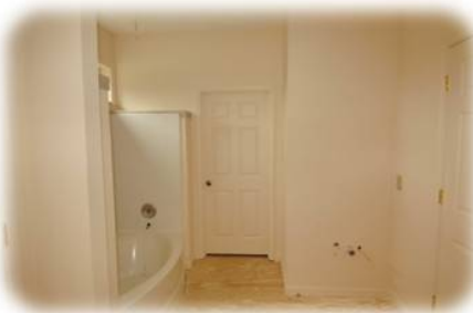
Main Level Master Lux Bath