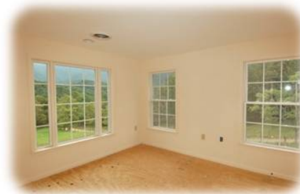
Upper Level Third Bedroom