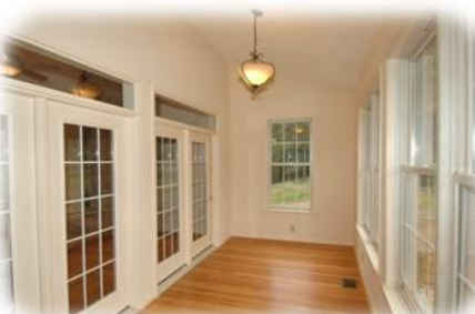
Sun Room with Vaulted Ceiling